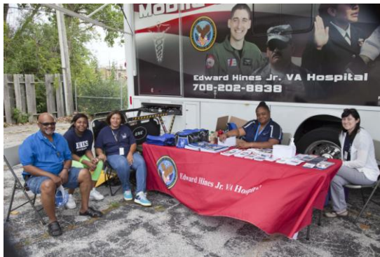
Volunteers from Hines VA provided support.