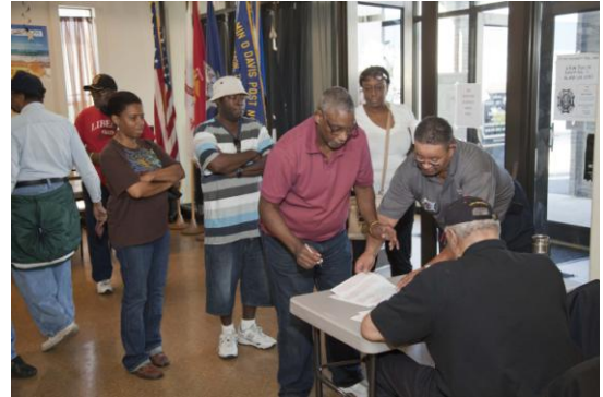
Members of Post 311 assisted with signing in of participants, volunteers and vendors.