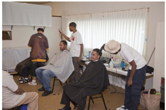
Haircuts were provided by volunteers