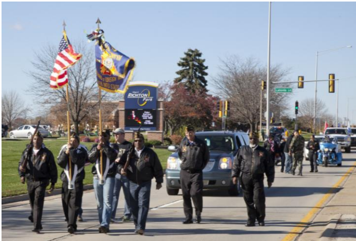
Leading the Way - Members of Post 311 Color Guard