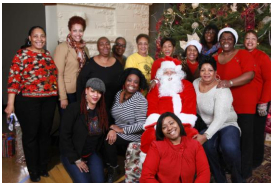
Members of Ladies Auxiliary