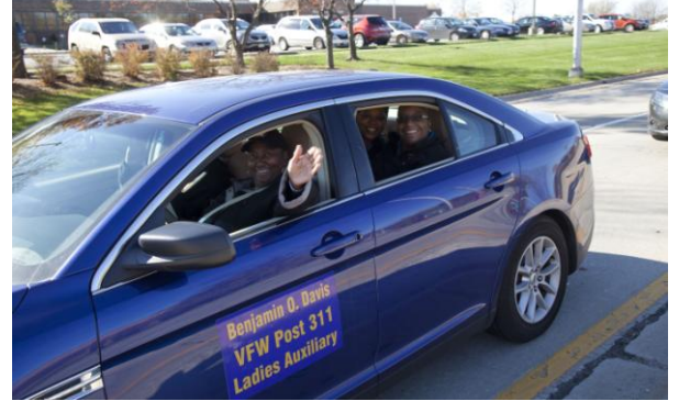
Members of the Ladies Auxiliary