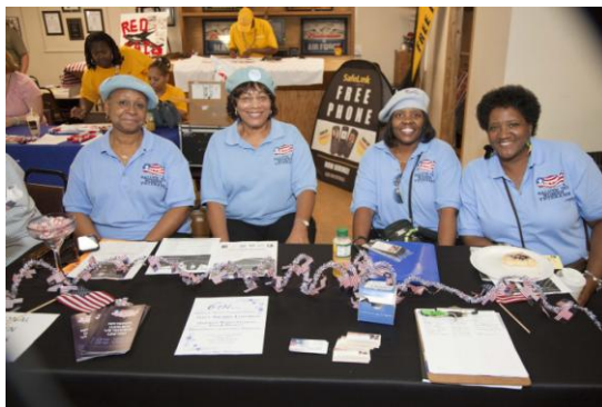
Volunteers from the National Women Veterans United organization