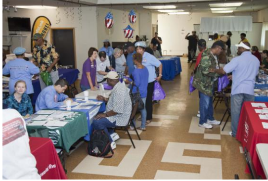
Close to 30 vendors offered services.