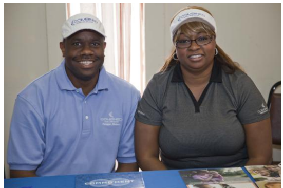
Team Combined Insurance provided support and services.