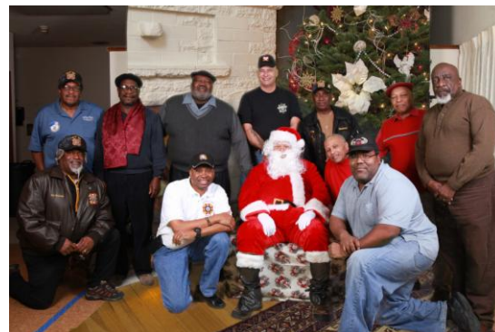
Members of Post 311