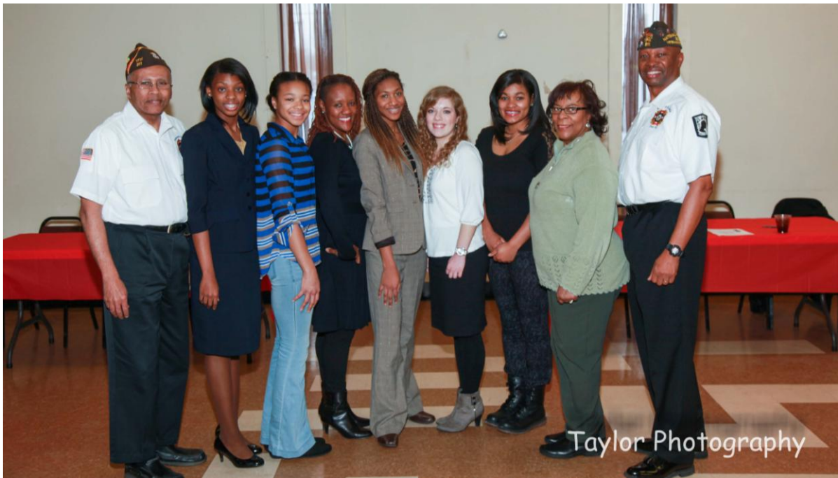
Certificates of Appreciation were presented to our VFW Essay Participates on December 15, 2013.