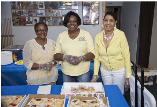
Members of New Faith Baptist Church – assisted with meal distribution.