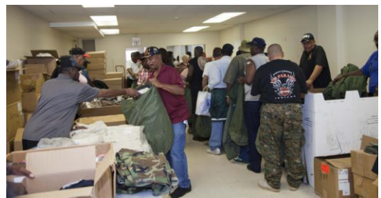
Excess Military Clothing Distribution – from Military Depot.