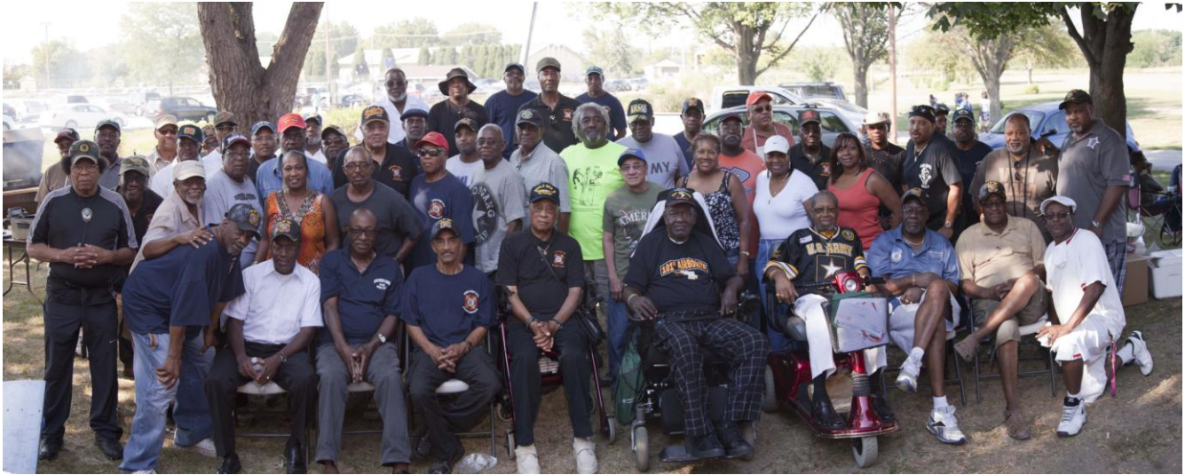
Annual Picnic with Members of Ladies Auxiliary – August 24, 2013